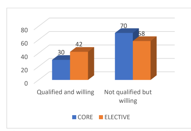
Figure 1 . Readiness of the CAS faculty to handle the new General Education courses.

The result revealed that of the 24 teachers, 30% are qualified to teach the core subjects and there are 70% who are not qualified but are willing to handle some of the subjects. For the Elective Courses, 42% are qualified and 58% are not qualified but willing to teach.