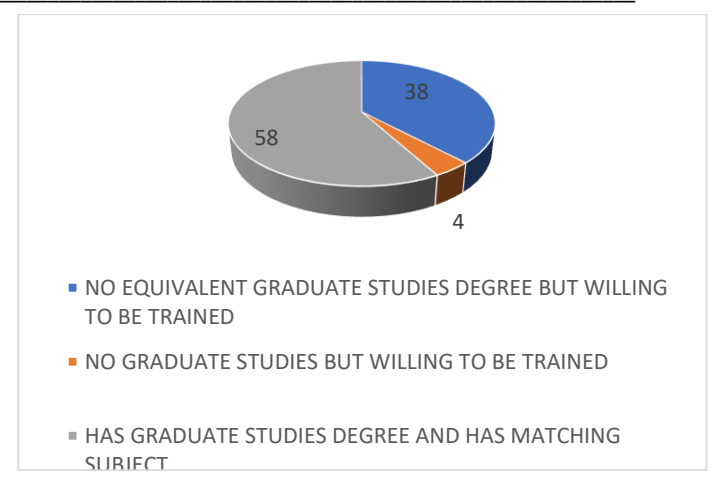
Figure 3. Summary of CAS faculty qualification for possible HRD intervention (In percentage)

Looking at Figure 3, it is evident that 58% of the CAS faculty has equivalent graduate degree studies and so very much qualified to teach the corresponding new General Education course/s. Of the 24 teachers, 4% have no graduate studies and 38% has no equivalent graduate studies degree of which both groups (totaling to 42%) are willing to be trained.